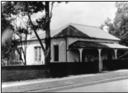
Gordon's First Post Office

This home, which housed the first Gordon Post Office, remains in existence as one of the oldest, if not the oldest, buildings in Kuring-gai and one of our