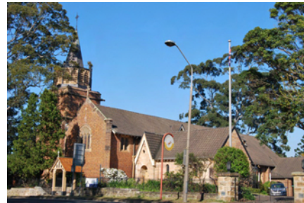
St Johns with the Blacket church in foreground