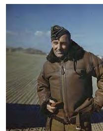
Sir Arthur Coningham, DFC

Their first son, Air Marshall Sir Arthur Coningham, KCB, KBE, DSO, MC,DFC, AFC, died in an air crash in 1948. See: https://archive.org/stream/Coningham-nsia/Coningham_djvu.txt