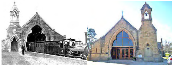
Mortuary Station/All Saints Church

We viewed the site of the original Mortuary Station, whose stone building was sold and dismantled in 1956 to be rebuilt, by the Vicar, as All Saints Church in Ainslie, a suburb of Canberra. The last train ran in 1948.