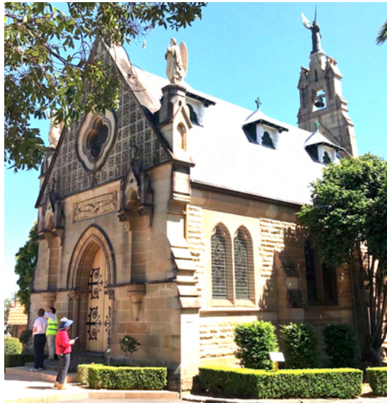
St Michael The Archangel Chapel