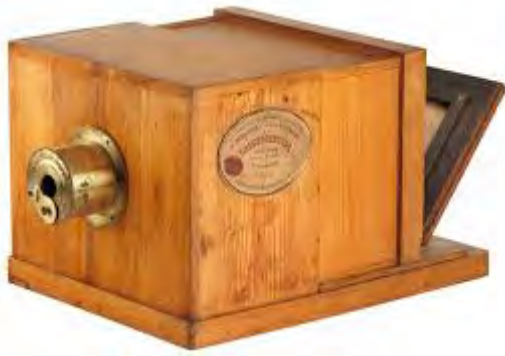
An example of an early camera