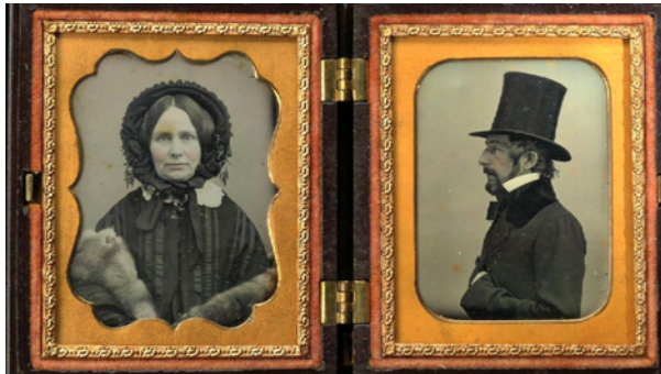
An example of a daguerreotype photo

1839 the one-off photo, 1849 the first camera, 1844 the first negative enabling more than one copy of the original, and 1847 the first photographic studio in Reading.