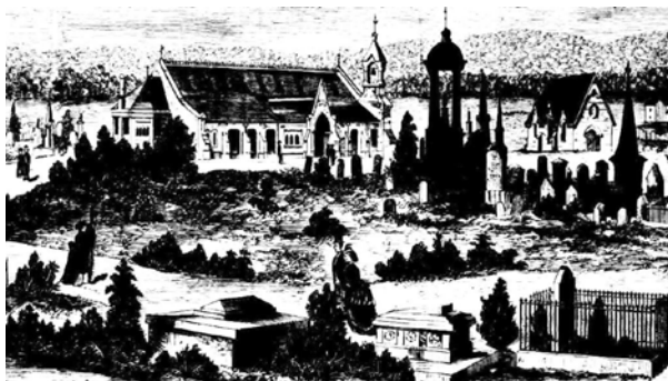
Sketch of Early Rookwood